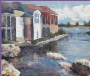
grades 9-12 Nanae Ikuta grade 12 Sleepy Summer (detail)