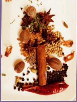
grades K-2 Mukta Joshi grade 2 Spice Tree