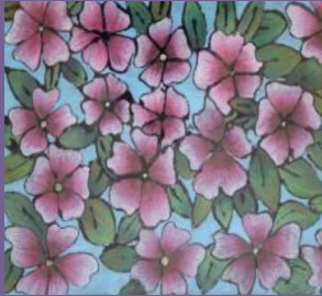
grades 3-5 Pravanya Sarma grade 4 Spring Flowers (detail)